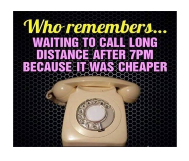
Long ago in a land far far away!