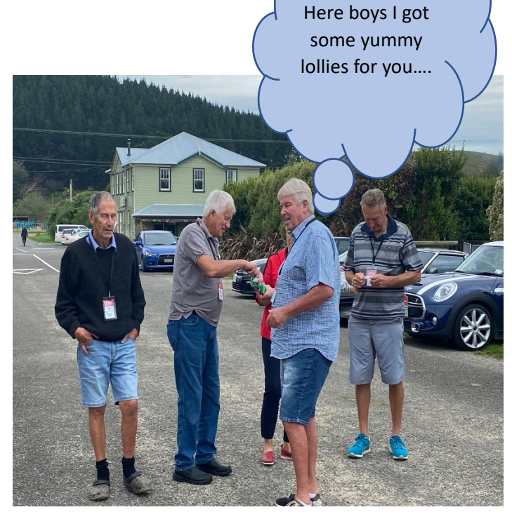
Handing out minties to give his brother the dentist more business