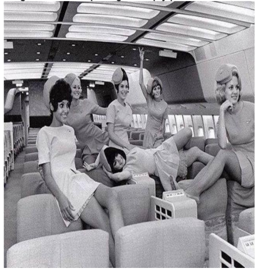
Flight Attendants posing on empty plane in the 60's..